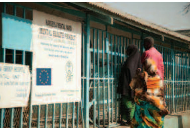
Relatives and friends seek to gain entry to the Hargeisa Group Hospital mental health ward, which at the time held around 40 male and 25 female patients, in Hargeisa, on July 29, 2015.

Based on research in the towns of Hargeisa, Berbera and Gabiley, this report examines the abuses against people with actual or perceived mental health conditions or psychosocial disabilities in public and private institutions. Between October 2014 and July 2015 Human Rights Watch visited two public mental health wards, six privately-run residential centers and one facility that uses traditional and religious practice to treat and purportedly heal inpatients. Human Rights Watch interviewed 115 people, including 47 people with actual or perceived psychosocial disabilities currently or formerly within institutions, and found that most residents experience abuses. These include arbitrary detention, chaining, verbal and physical abuse, involuntary medication, overcrowding and poor conditions. Basic due process, judicial oversight and channels of redress are non-existent. Although women with psychosocial disabilities also suffer serious abuses in healing centers and in their communities, this reports focuses largely on men, because most of the centers hold men.