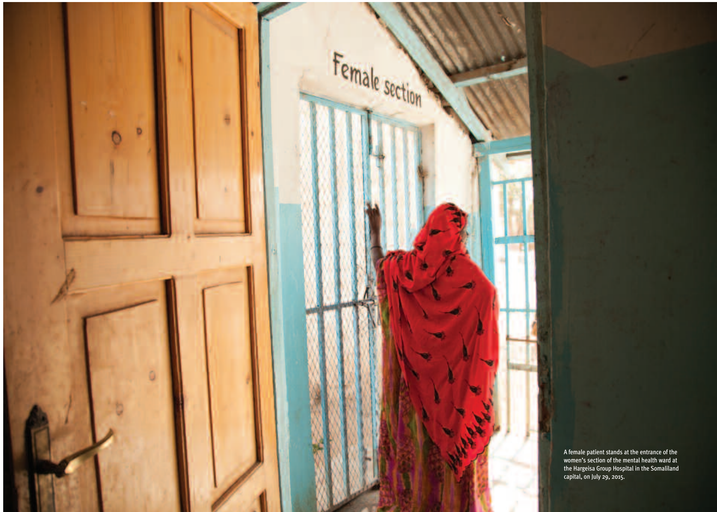
A female patient stands at the entrance of the women's section of the mental health ward at the Hargeisa Group Hospital in the Somaliland capital, on July 29, 2015.

Families and relatives are the main support systems available to individuals with psychosocial disabilities, but often struggle to provide effective support, given the lack of community-support systems such as outpatient medical services and counselling based on free and informed consent. Family members are often ill-informed, with limited information about mental health conditions and what constitutes sound treatment and care, and must confront significant social stigma. Some rely on traditional